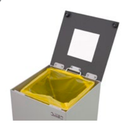
Inner ring bag holder